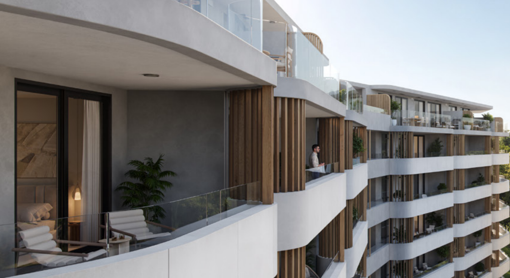
Artist impression: The Merewether, Newcastle, DREP2

Partner with a leading Australasian real asset manager of choice