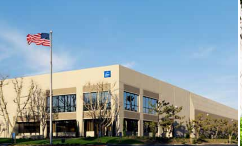
L to R: 1777 S Vintage Avenue, Ontario, CA; 83 Clarence Street, Sydney, NSW

DEXUS and AMP are working together to transition fund management of the AXA mandate to AMP by 31 May 2012.