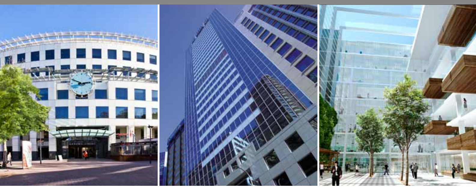
L to R: Garema Court, 140-180 City Walk, Canberra, ACT; 45 Clarence Street, Sydney, NSW; Artist's impression of Flinders Gate Complex, Melbourne, VIC