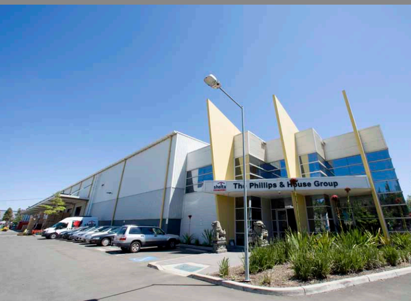
1 Foundation Place, Greystanes, NSW