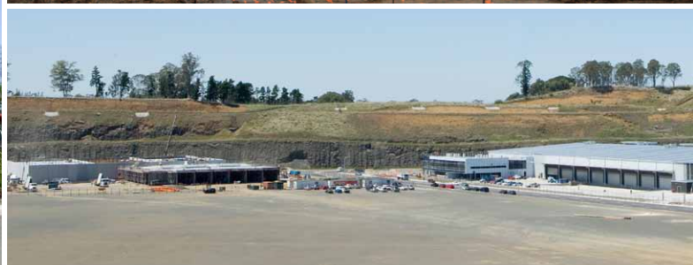
Top: Loscam development, DEXUS Industrial Estate, Boundary Road, Laverton North, VIC Above: Developments at Quarry Industrial Estate, Reconciliation Road, Greystanes, NSW