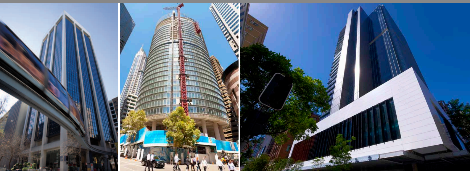
L to R: 44 Market Street, Sydney, NSW; 1 Bligh Street, Sydney, NSW; 123 Albert Street, Brisbane, QLD