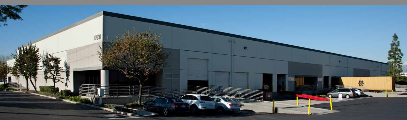
Golden Pacific Business Park, 1100 S Hatcher Avenue & 17524-17531 Railroad Street, Industry, CA