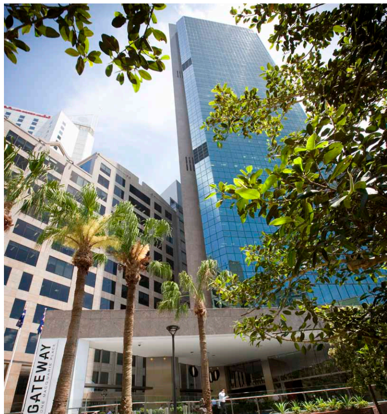
Gateway, 1 Macquarie Place, Sydney, NSW

In line with the Energy Efficiency and Opportunity Act (EEO), we have submitted our Assessment and Reporting Schedule setting out our objectives over the next five years for energy reduction.