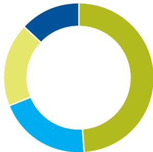
direct property portfolio by sector as at 31 December 2005