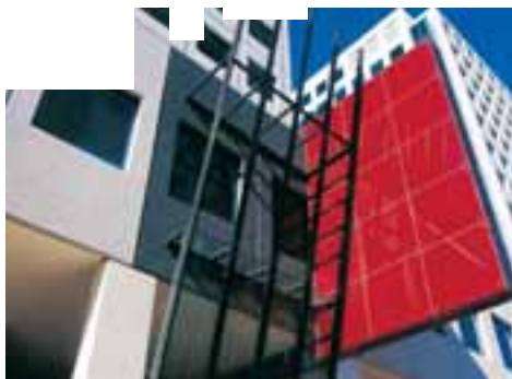
14 Moore Street, Canberra ACT

As a result, including current heads of agreement, the commercial portfolio's occupancy increased to 97.5 percent, from 92.3 percent in December 2004. The leasing activity has helped extend the portfolio's average lease term to expiry by income to 6.6 years from 5.9 years at December 2004.