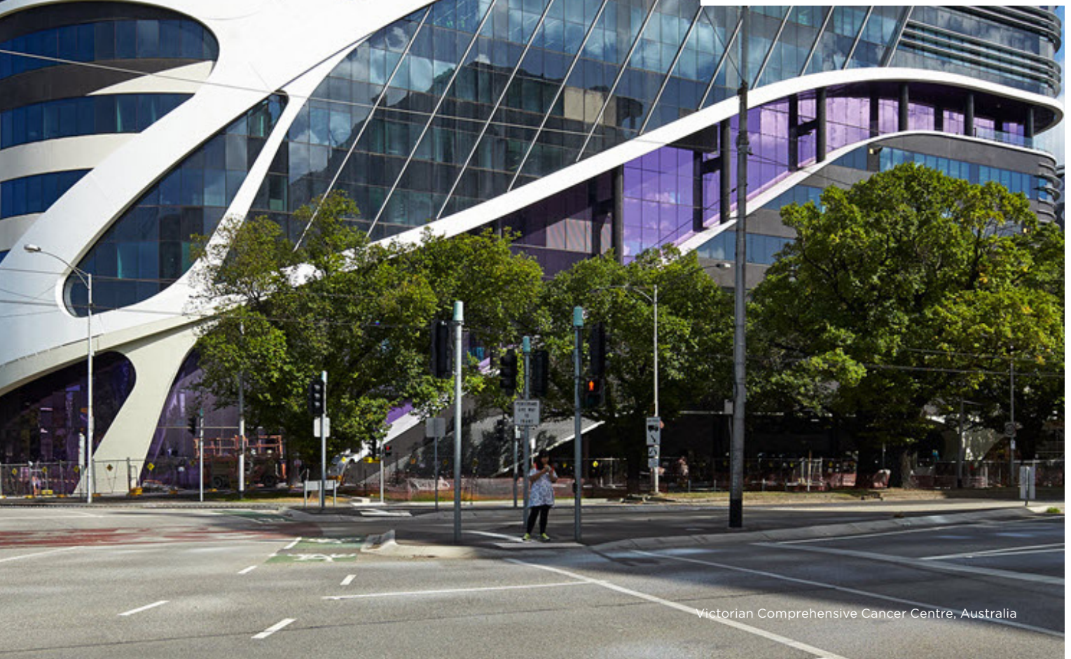
Victorian Comprehensive Cancer Centre, Australia

Continuous training on ESG and responsible investment is provided in a variety of forms across the organisation. ESG induction training is provided to all new Infrastructure staff. Ongoing executive level training and knowledge sharing is provided through transaction focused learning, sector focused research, asset management analysis and bespoke staff education programmes.