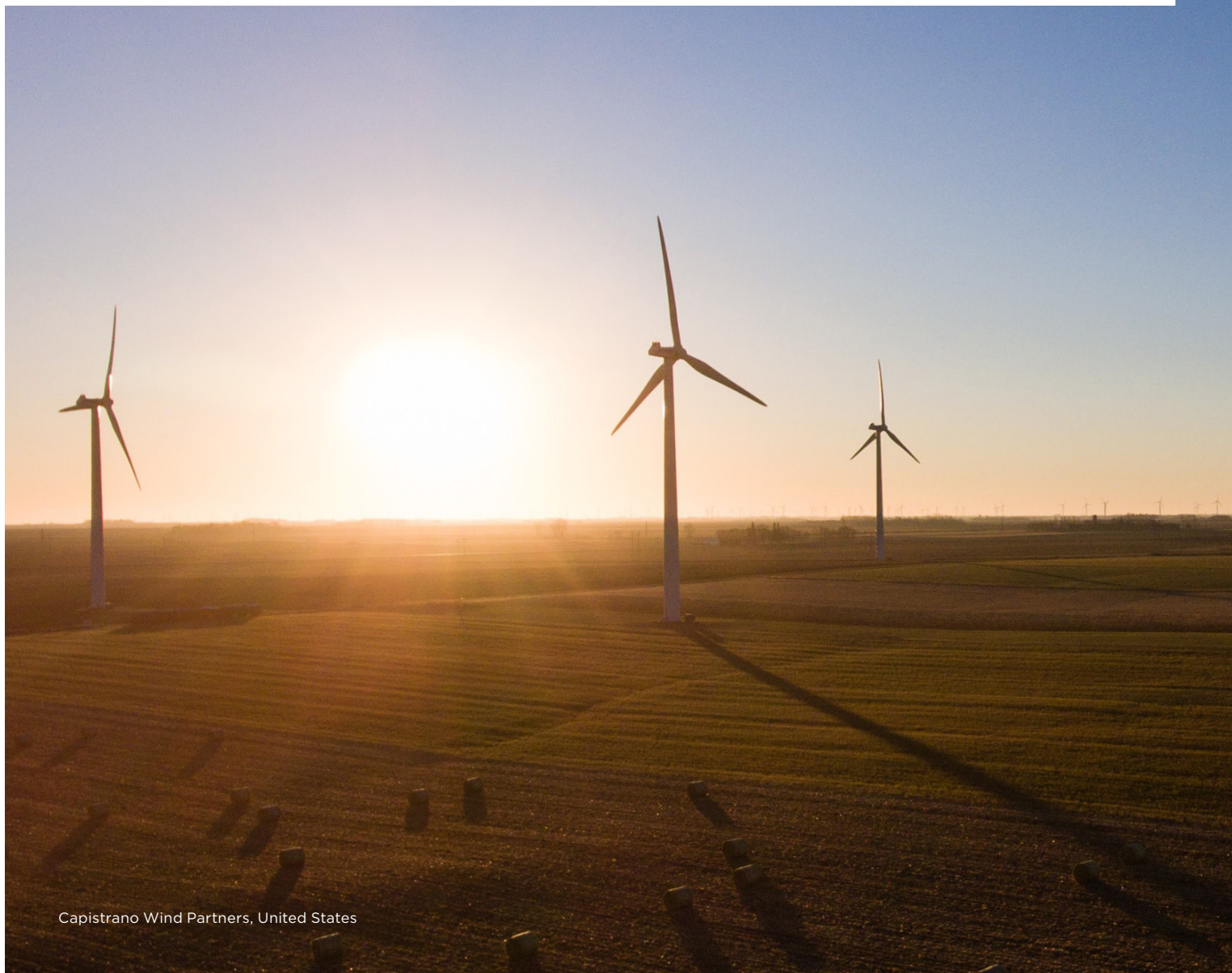
Capistrano Wind Partners, United States

While core infrastructure assets generally have their own board and in-house management team to address corporate and operational issues, some social infrastructure investments rely heavily on third-party operators to provide operational support, maintenance and facilities management activities. Where infrastructure asset managers are responsible for managing third-party service delivery, monitoring and driving improved ESG performance is an important aspect of the role. Monitoring of ESG related activities is facilitated through standardised reporting, site visits/inspections by the AMP Capital team and regular forums with stakeholders to progress ESG initiatives for each of the investments.